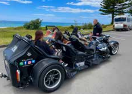
V8 Trike Tours v8triketours.co.nz | Ph 022 225 5647