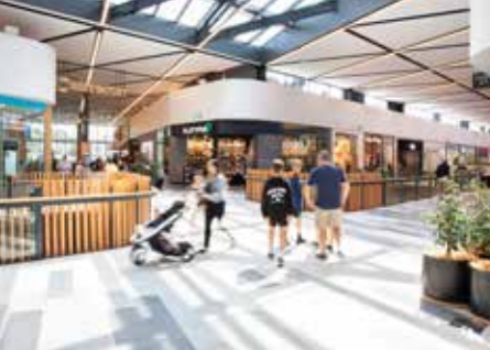
Tauranga Crossing Shopping Centre taurangacrossing.co.nz | Ph 07 777 0125