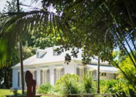
The Elms | Te Papa theelms.org.nz | Ph 07 577 9772