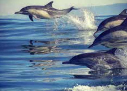
Bay Explorer bayexplorer.co.nz | Ph 021 605 968