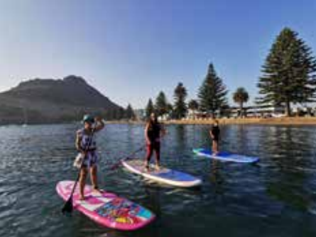
Mauao Adventures mauoadventures.co.nz | Ph 027 451 0579

Sure to make You smile BAYOFFLENTYNZ.COM