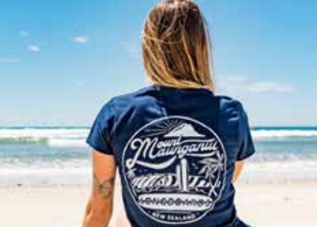
Mount Longboards mountlongboards.com | Ph 07 574 3888