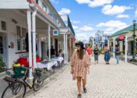
The Historic Village historicvillage.co.nz | Ph 07 571 3700