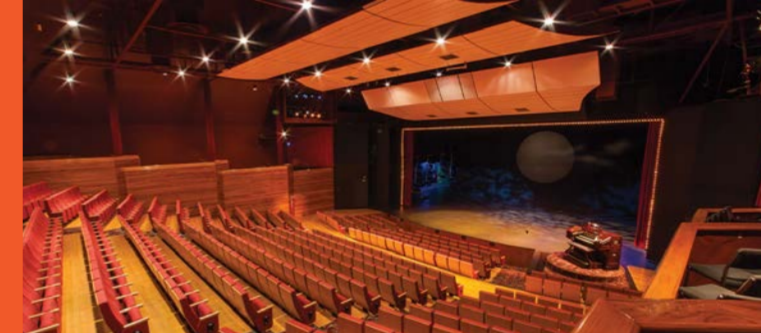
Baycourt Community & Arts Centre baycourt.co.nz | Ph 07 577 7188