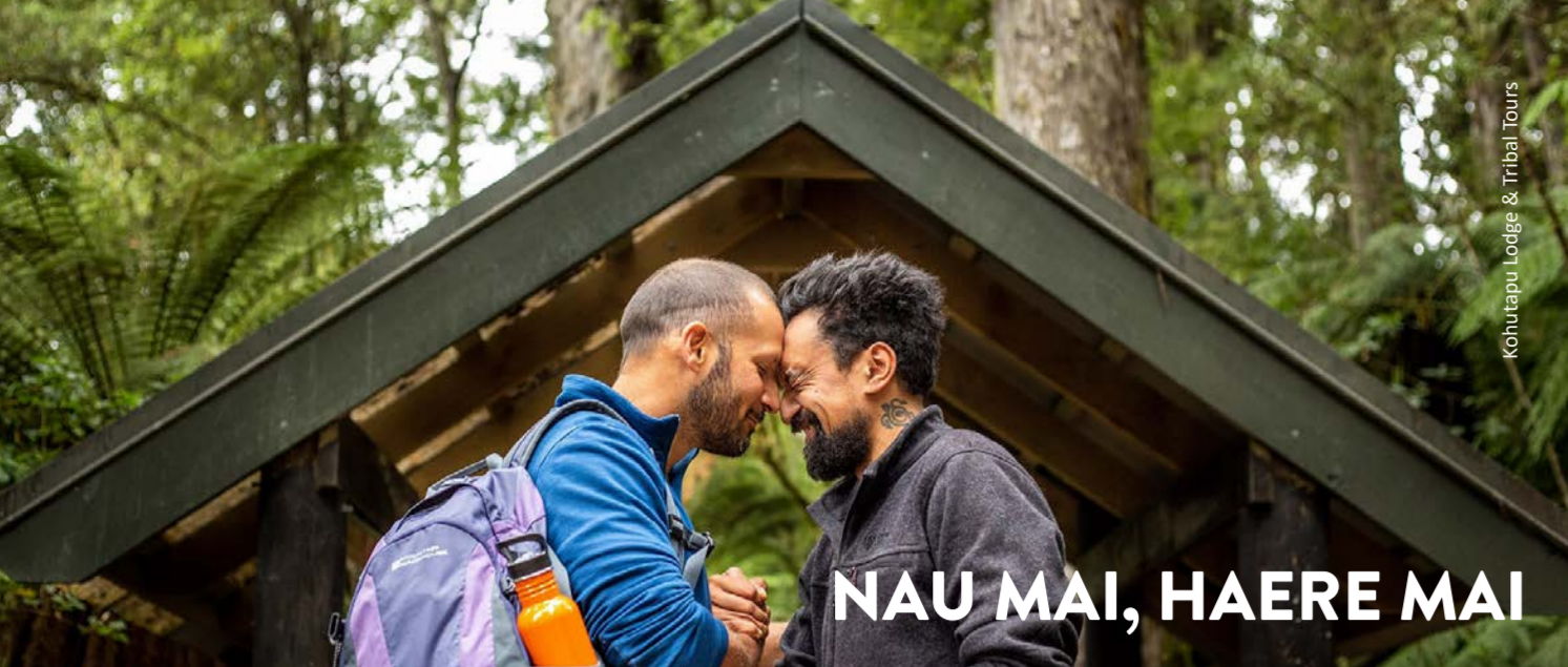
Kohutapu Lodge & Tribal Tours