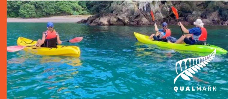
KG Kayaks - Tours & Freedom Hires kgkayaks.co.nz | Ph 027 272 4073