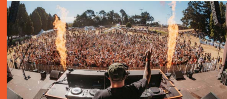
What's On Tauranga Find out what's on at whatsontauranga.co.nz