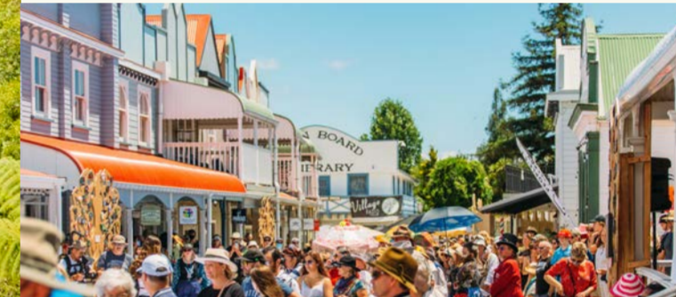
The Historic Village historicvillage.co.nz | Ph 07 571 3700