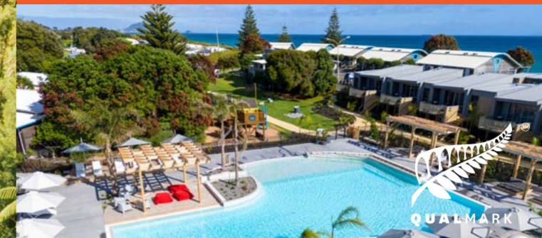
Tasman Holiday Parks - Pāpāmoa Beach tasmanholidayparks.com/nz/papamo-a-beach | Ph 07 572 0816