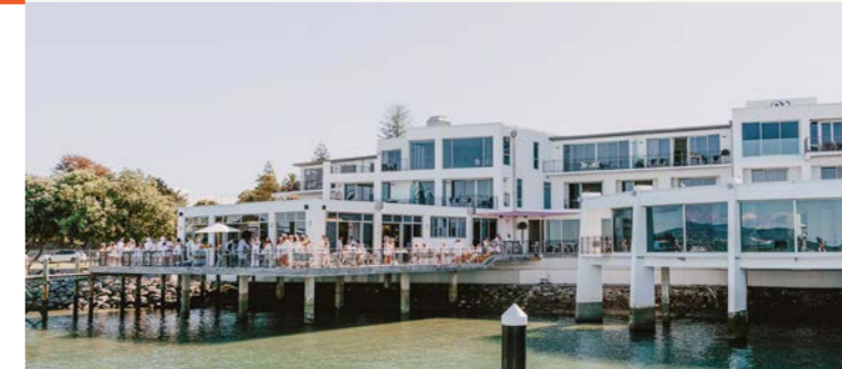
Trinity Wharf Hotel | Waterfront Restaurant & Bar trinitywharf.co.nz | Ph 07 577 8700