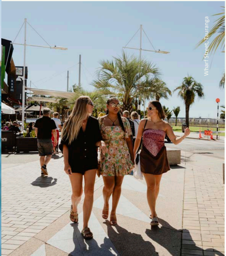
Wharf Street, Tauranga