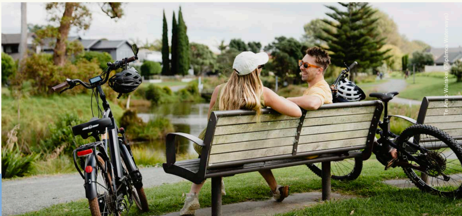
Te Aho - Waiakohi (Papamoa, Mount Maunganui)

This scenic trail features historic landmarks, superb native forest, stunning coastal views, seabird colonies, and native birdlife. Spanning three major reserves, the track can be undertaken in sections or as a 16km round trip.