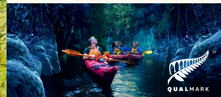
Waimarino Kayak Tours glowwormkayaking.com | Ph 0800 456 996