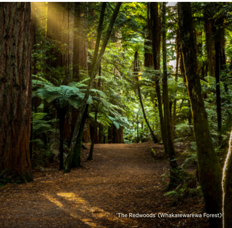
'The Redwoods' (Whakarewarewa Forest)