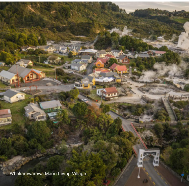
Whakarewarewa Māori Living Village